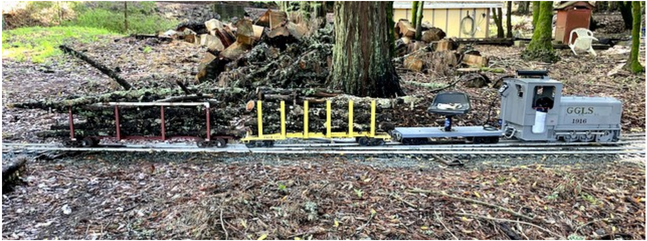
The GGLS Paul Bunyan log hauling work train put together by Rich Croll Well done, Rich!